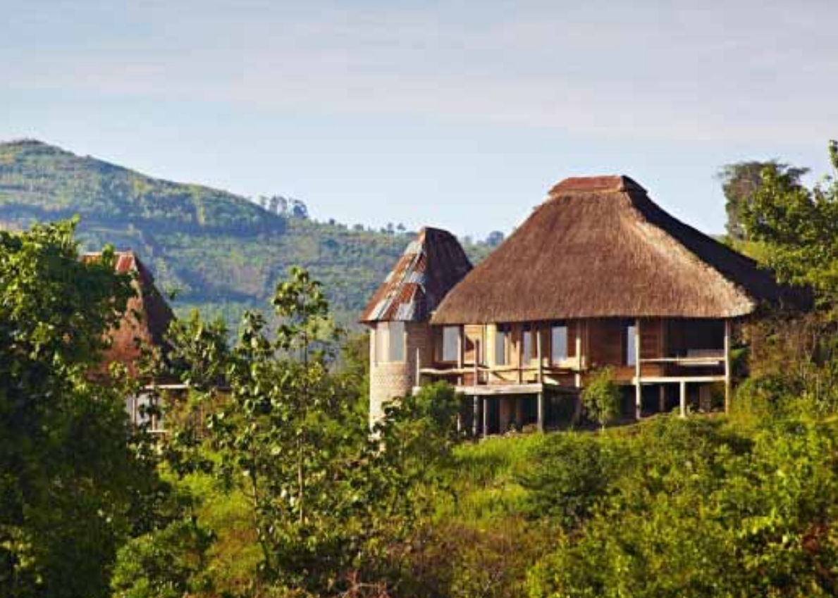
Above: Kyambura Gorge Lodge, Uganda. Below: Tropic Air is hosting a helicopter safari to the Congo region with Roberts Safaris.