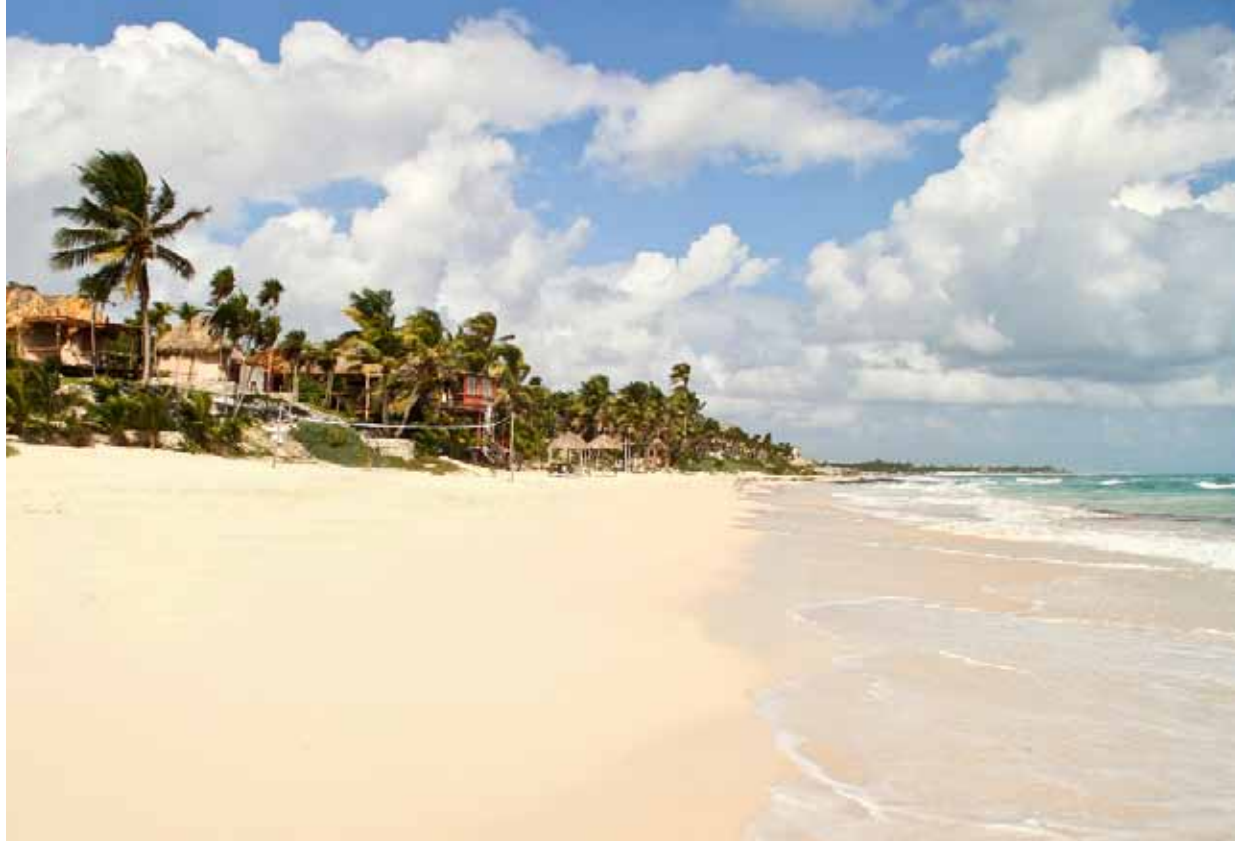
Above: Papaya Playa at Tulum, Mexico. Below: the 16th-century Château de Fées in Provence.