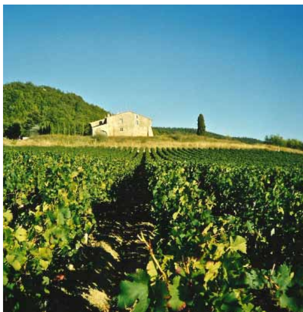
Above: Il Cocceto in the Val d'Orcia, Tuscany.