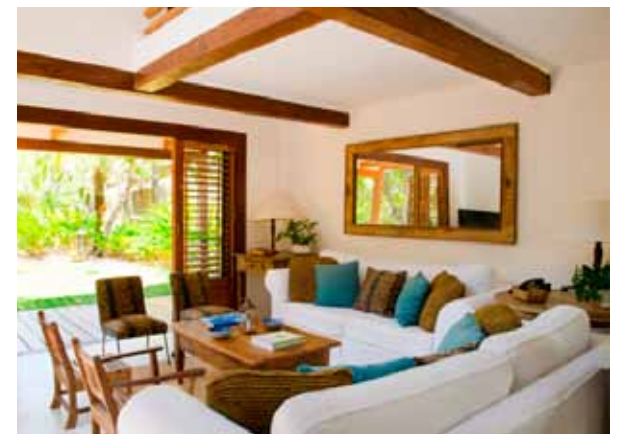
Above: a room at Etnia Clube de Mar in Bahia, Brazil.